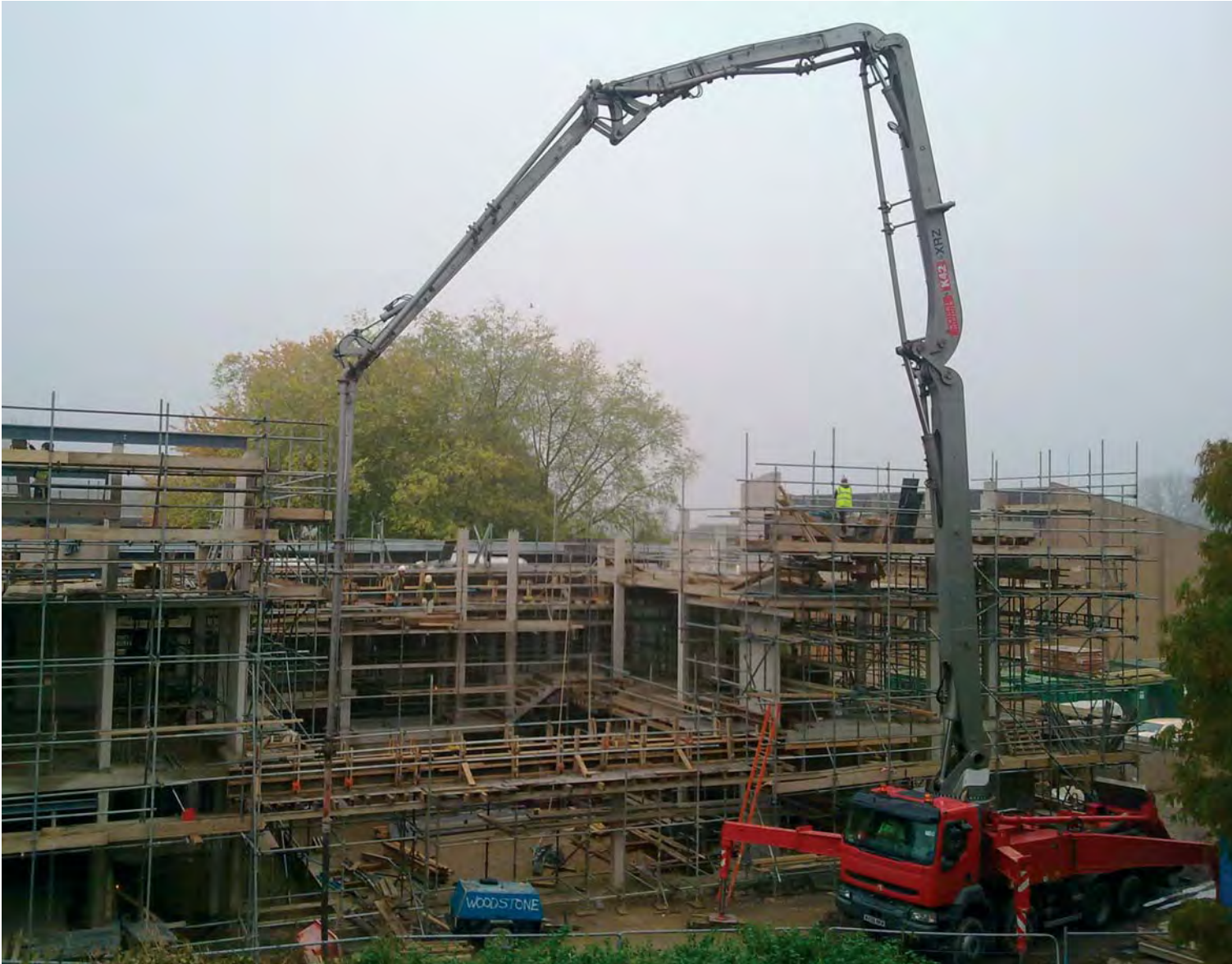
THE NEW MUSIC SCHOOL OCTOBER 2009